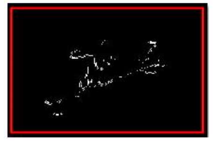
Fig.2. Binary Image interpreting the bit value of 0 as black and 1 as white

Features Extraction is the key to develop an offline signature recognition system. We use a set of five global features that cannot be affected by the temporal shift.